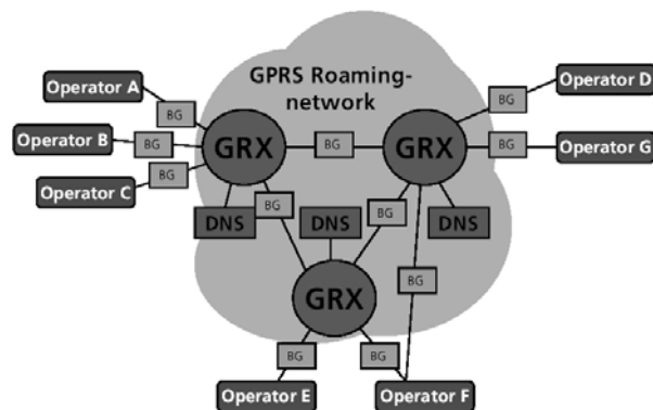
Figure 1. The GPRS Roaming Network

The GRXs charge and pay the service used between them selves as defined in the SLA between the GRXs.